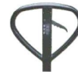
*Standard: metal handle