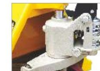
Integrated cast pump