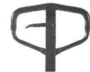
*Option: rubber wrapped handle