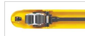
Standard with entry & exist Roller (option with single or double fork rollers)